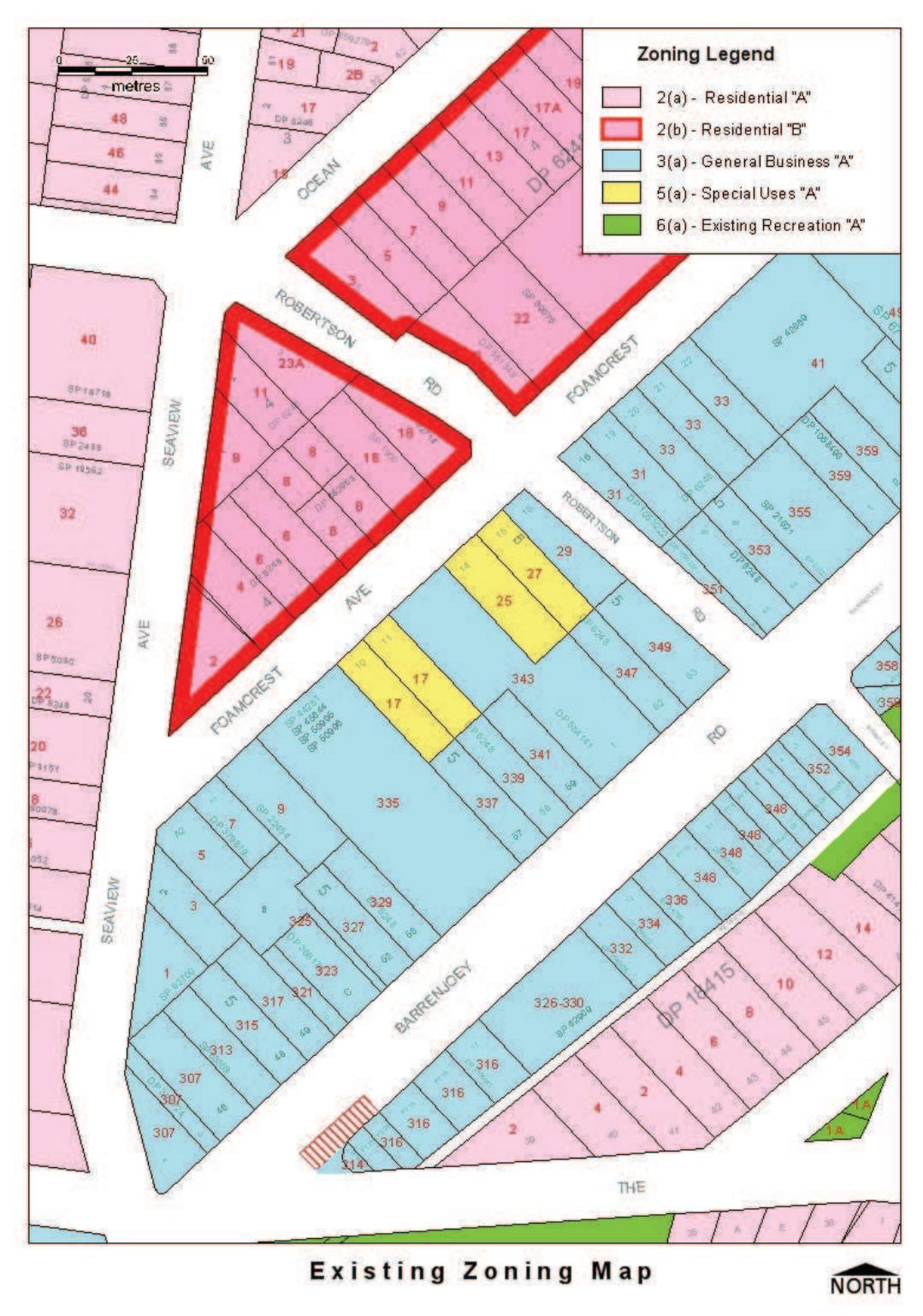
MAP 1: Existing Zoning

Subject Site: Lots 10, 11, 14 & 15 Section 5 Deposited Plan 6248 (17, 25-27 Foamcrest Avenue Newport)