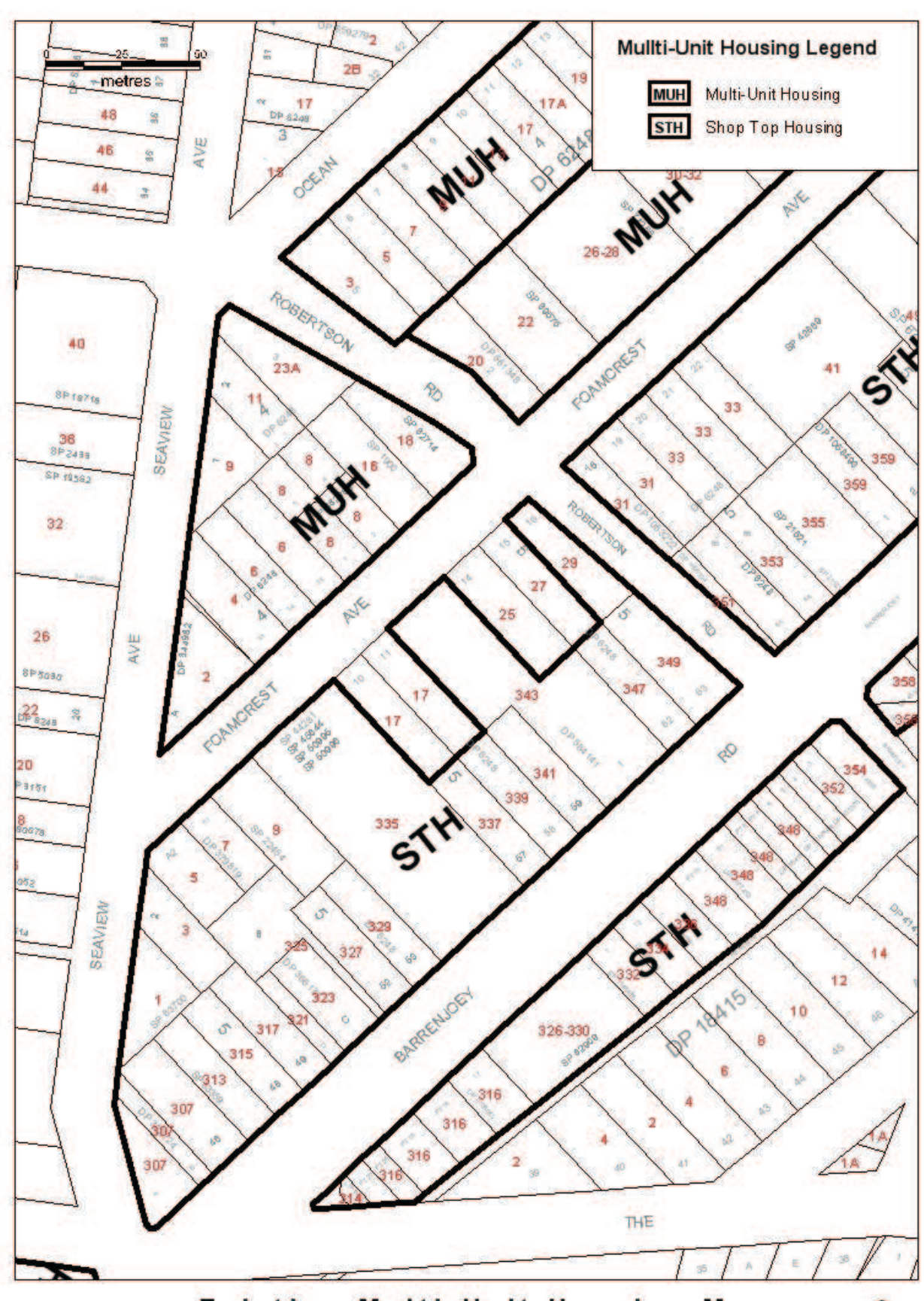
MAP 3: Existing Multi-Unit Housing Map