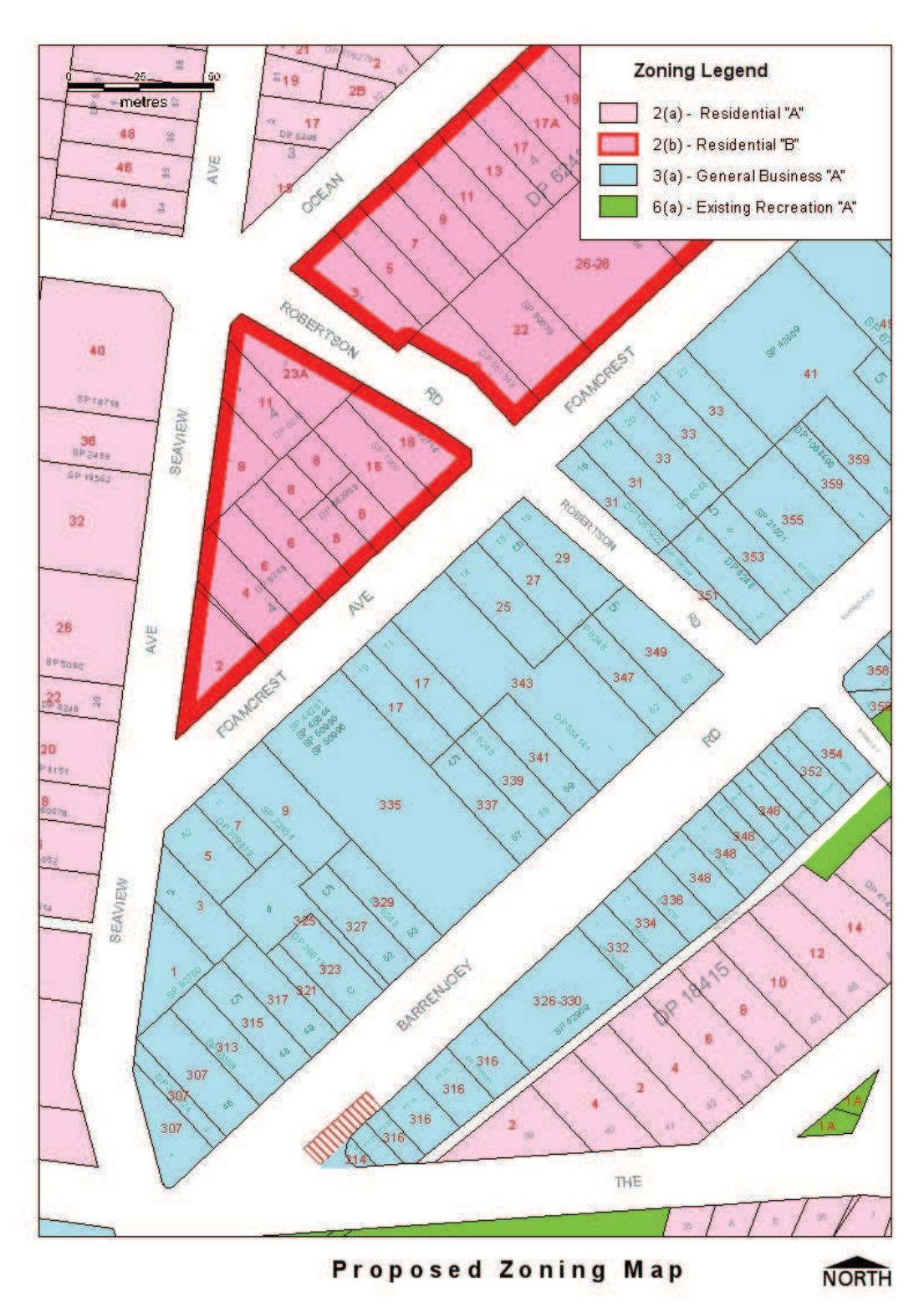
Subject Site: Lots 10, 11, 14 & 15 Section 5 Deposited Plan 6248 (17, 25-27 Foamcrest Avenue Newport)